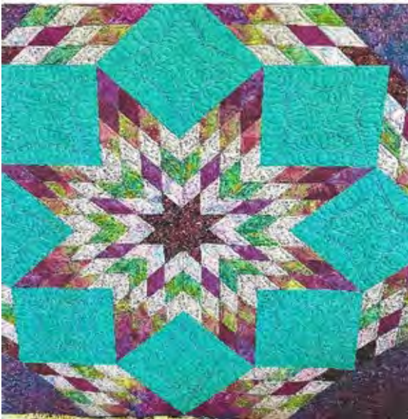
“Fill in the Blanks” – Mary Bernower Domestic Machine Quilting Beginning to Intermediate

One 15 inch block is used to create a look of center and an intricate looking border. 15” block consists of one 9”sq of focal fabric surrounded by one dark, one medium and one light 1 ½” strips of complimentary fabrics. Pattern “Costa Maya” available on Amazon and Etsy. Rulers: 15” square, 6 ½” ruler and one long ruler needed. Quilt size 72” X 72”