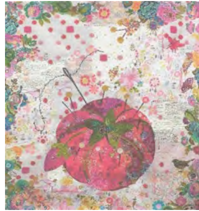
“AMAZING COLLAGE QUILTING” Judy Phillips Collage Beginner

Create a personal and unique quilt. The design of the quilt spells out SURVIVOR in Morse Code. Quilt can be made in traditional pink or in any color of choice. Instructors will help with colors and will have some kits for sale in the traditional pink.