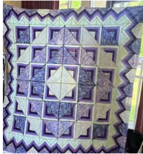
ADAPTATION OF “COSTA MAYA”- Carolyn Artle Piecing Intermediate

Original Design for the 2025 Getaway. Retro design can be a wall hanging or center of a quilt. Pattern will include instructions, full size placement chart and all applique pieces ready to trace on fusible web. Pattern cost is $22.00. Project size 31.5” X 41”