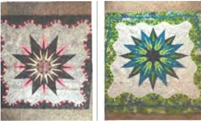
“VINTAGE COMPASS” Laura Noletti Paper Piecing Intermediate

This striking project can be made in your choice of Fabrics. Paper piecing makes complex designs easy and enjoyable. Pattern is Vintage Compass by Quiltworx $35 includes papers. Instructor has patterns for sale. Add a quarter ruler is necessary ($10-$14) Quilt size is 62” X 62”.