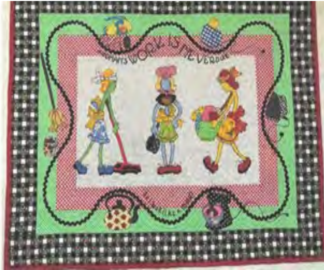
“NEVER DONE”- Elizabeth Bauman Raw Edge Machine Applique Confident Beginner

Original Design for the 2025 Getaway. Retro design can be a wall hanging or center of a quilt. Pattern will include instructions, full size placement chart and all applique pieces ready to trace on fusible web. Pattern cost is $22.00. Project size 31.5” X 41”