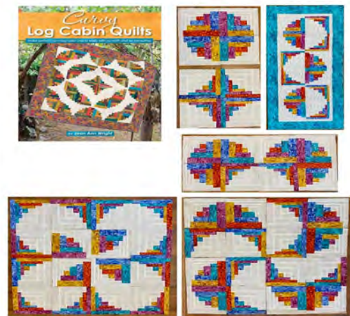
“CURVY LOG CABIN QUILT” K. C. Howell Machine Piecing Confident Beginner

Learn a new technique. Break free from traditional patterns. Cut and paste fabrics to create unique collage designs. Kit fee and pattern fee. Various patterns are for sale at Sew Déjà Vu or on the shop’s website. Instructor will have some essentials for sale.