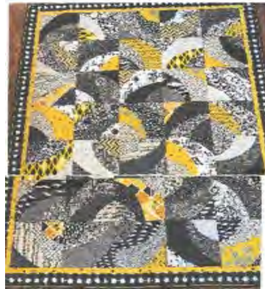
“RED ONION” Cathy Parker Piecing Confident Beginner

We will practice various free hand quilting designs, the use of stencils and rulers to fill in the blanks on a quilt top. We will design a small whole cloth or use a pre-printed panel. (picture is to show quilting not class design).