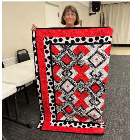
Photos from Show & Tell