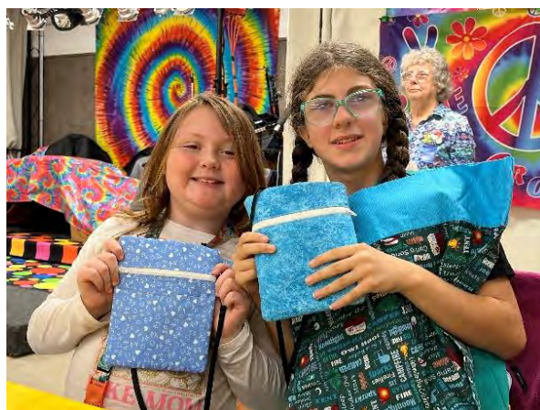
Girl Scouts with their Grant projects